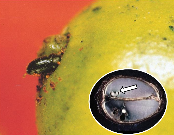
Coffee berry borer (INSECT – Hypothenemus hampei)