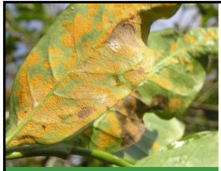
Coffee leaf rust (FUNGUS - Hemileia vastatrix )