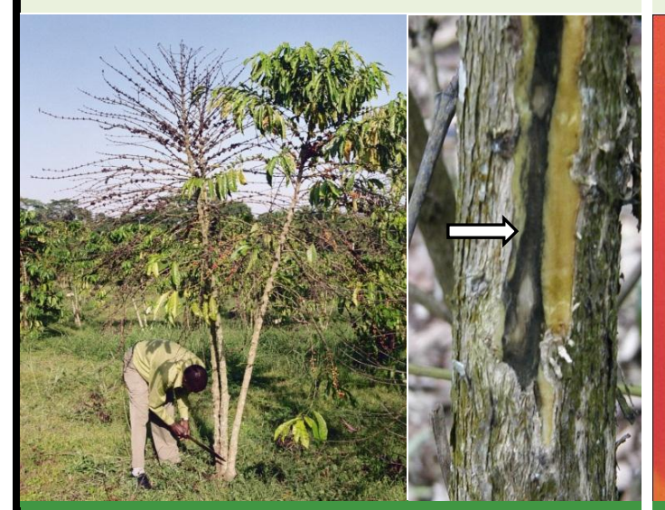
Coffee wilt disease (FUNGUS - Gibberella xylarioides )