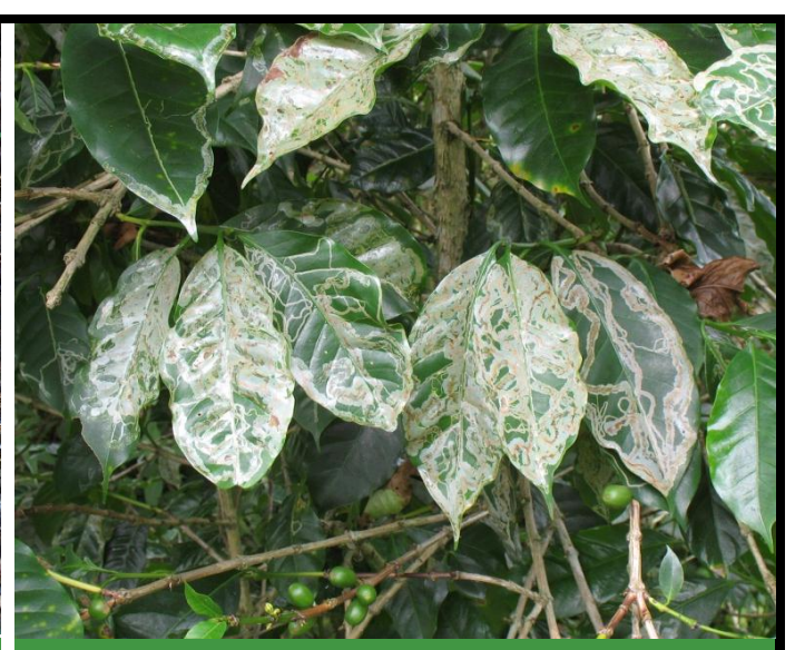
Leaf miner (INSECT - Leucoptera species ) © E. Boa)