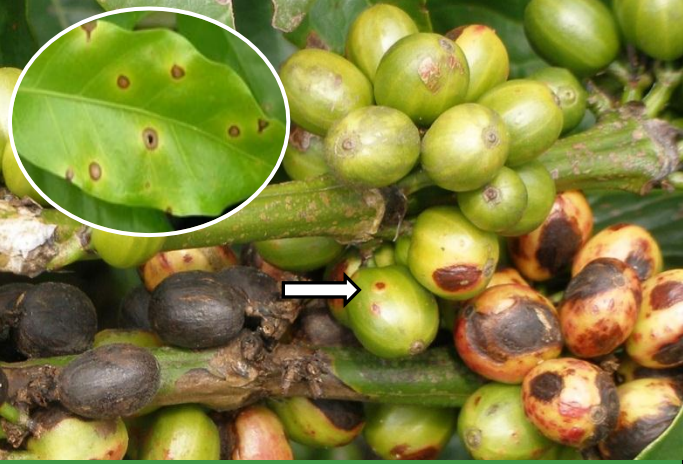
Brown eye spot (FUNGUS – Cercospora coffeicola)