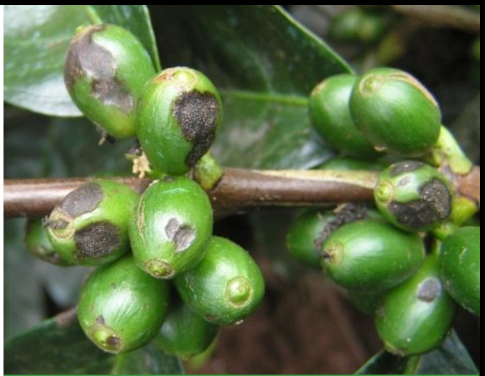
Coffee berry disease (FUNGUS - Colletotrichum kahawae)